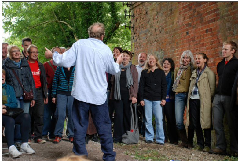
Left: The Feral Choir giving their all for Picnic on the Path